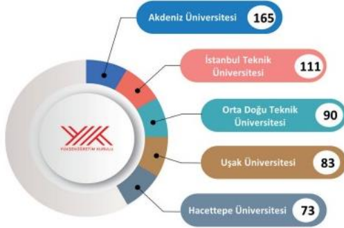
İ.2-4 Uluslararası değişim programlarına katılan öğretim elemanı sayısının en yüksek olduğu üniversiteler

Rankings by the Times Higher Education (THE), especially in the fields of medicine, health, and natural sciences, has significantly contributed to enhancing our international visibility."