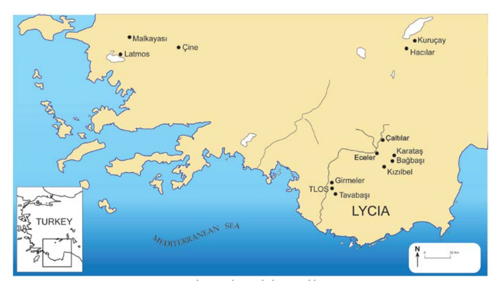
Fig. 1. The Location of Tlos (Korkut – Uygun 2017, fig. 6. 1).

within the Heracles iconographies, which were popularly used in the visual narratives of Greek and Roman periods, based on the examples from Tlos. In addition, apart from the use of the character Heracles as a motive, its existence within the Lycian religious system and its relationship with local deities will be examined in the same section.